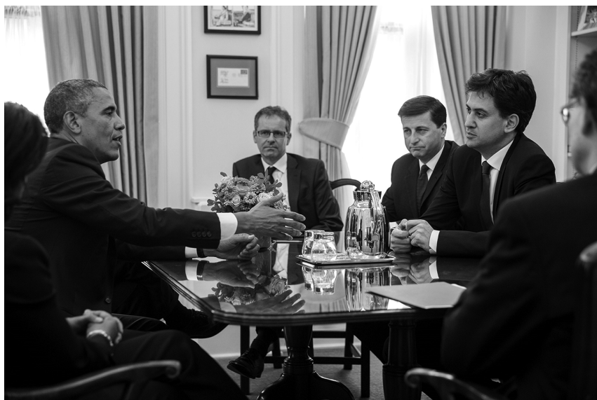
Figure 19.2 President Barack Obama drops by National Security Advisor Susan E. Rice's meeting with Opposition Leader Ed Miliband of the United Kingdom, in the National Security Advisor's West Wing Office of the White House, July 21, 2014.

Labour candidates and activists would return from the doorstep bamboozled by what to do about the 'Ed Miliband problem'. The double whammy of Alan Johnson's forced resignation was that as Miliband's deputy, as he would have become in all but name, Johnson would not only have helped on the economic side, but he would have helped to compensate for Miliband's lack of personal appeal.